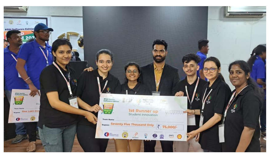
Team 'The HEX_CLAN' @SIH 2022