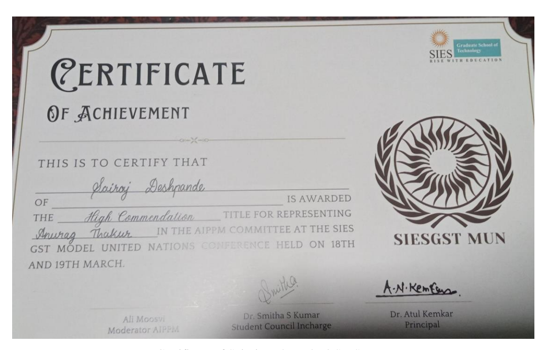
Certificate of Sairaj Deshpande @SIESMUN