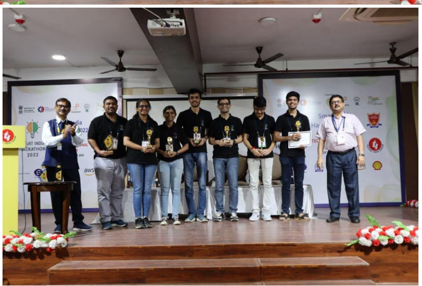
Team 'Bytecoders!' @SIH 2022