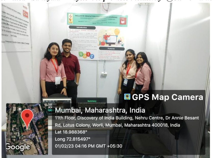
Project titles 'Inclusive Education for Diverse Learning' @CiiA-3 Exhibition